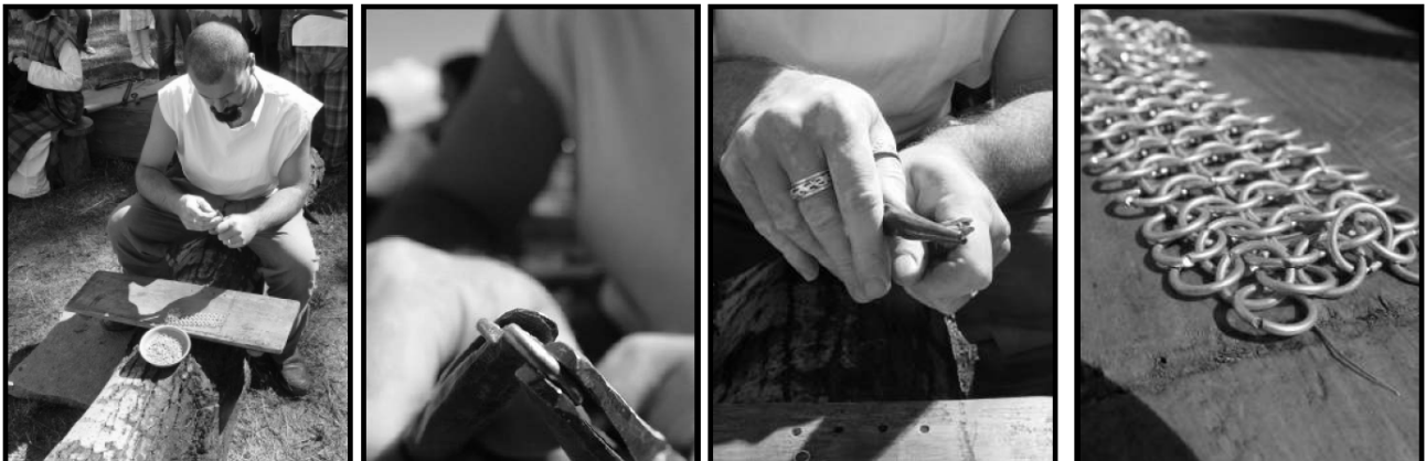
(Magiaceltica 2006 – Trentino)

The practical activities mainly consist of the accurate reconstruction of archaeological finds, i.e. objects which were commonly used in the Iron Age. In order to do so, we also reproduced the tools and the manufacturing phases carried out at that time; such activities are performed during the historic camp events, too. One of the handcraft processing techniques which we re-enact is the construction of chainmail vests, armors used by Celt warriors. This handcraft products are manufactured entirely by hand, ring after ring.