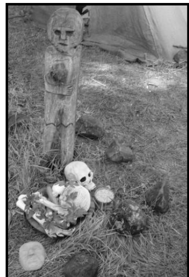
(Magiaceltica 2006 – Trentino)