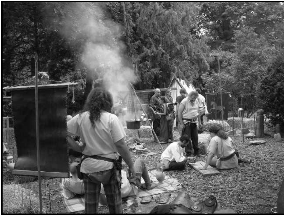
(Taurino Brigas 2006 – Pecetto Torinese)

Our activities are both practical – documented reconstruction of clothing, weapons, handcraft products, food and beverages used during our recreational history events; participation in Celtic festivals and rendezvous, mounting and living in our camps and performing historic combat simulations – and theoretical – holding conferences, visiting exhibitions, writing articles in sector specific publications.